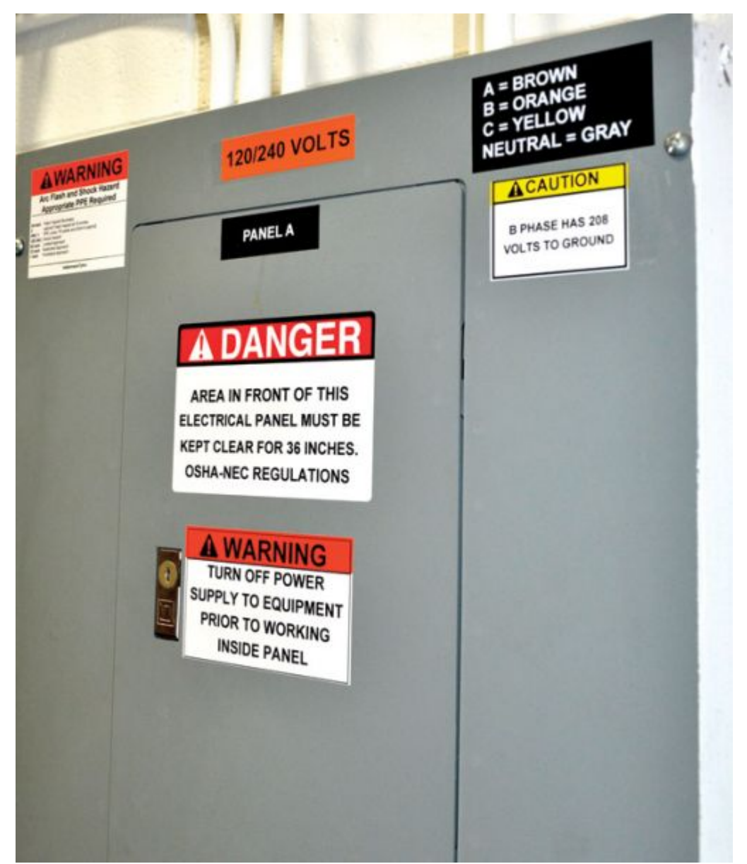
Photo 4. This panel shows all the appropriate labeling as required by the NEC and NFPA 70E, per ANSI Z535 label design formats. Note how the phases are marked in this example.

This is also why it is essential to label your high leg per NEC 408.3(F)(1), which states that a switchboard or panelboard containing a 4-wire delta-connected system, where the mid-point of one phase winding is grounded, shall be field marked to indicate which phase is going to ground and the associated voltage. Also remember to mark any circuits that are backfed. Each group-operated isolating switch or disconnecting means shall bear a notice to the effect that contacts on either side of the device might be energized per NEC 225.70(4).