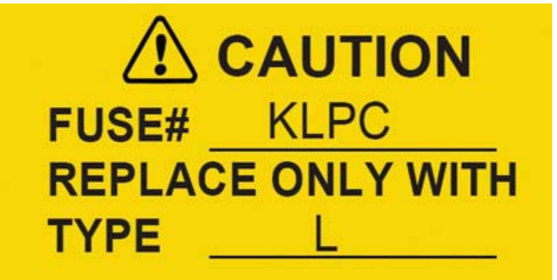
Fig 2. To maintain the proper SCCR rating, any fuses that must be replaced have to be the same type and rating as the original fuse. In this case, a simple label that identifies the replacement fuse is critical to maintain the system.

For some applications (e.g., grounding, fuse plugs, tap bars, and terminal blocks), the manufacturer might specify a specific torque value. NEC 110.3(A) covers the examination, inspection, and installation of equipment. Many manufacturers will place a "torque" label next to or adjacent to the equipment ( Photo 2 ) to make it easier for the inspector or whoever is doing service to maintain the integrity of the system.