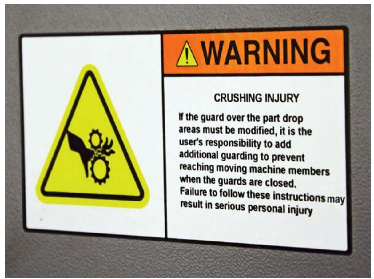
Photo 6. Pictograms can be used to identify hazards visually within the warning label.

Per ANSI Z535.4-2011, Sec. 6.3: a safety alert symbol, when used with the signal word, shall precede the signal word.