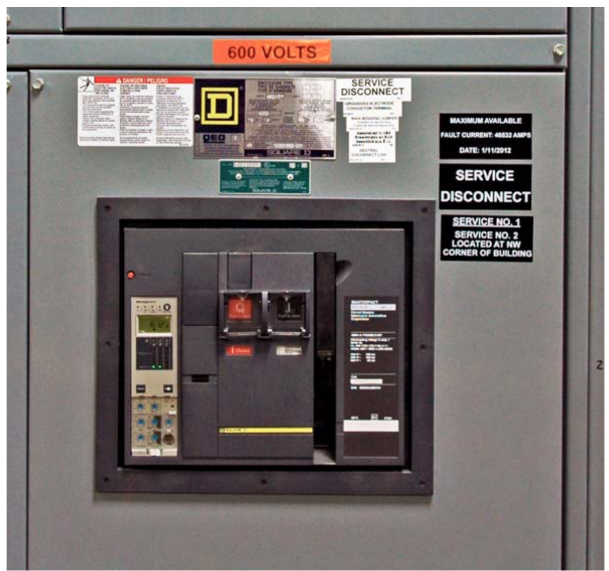
Photo 1. This image shows labels provided by the equipment manufacturer and those field marked by the installer. Note how the labels indicate system voltage and maximum fault current, as well as identify the equipment as a service disconnect. Per ANSI Z535.4, Art. 7.3 and Art. 8.1.2, informational labels like these can be made with white text on a black background or black text on a white background. Always follow the requirements of ANSI Z535 for designing your field-marked labels.

First, ensure that the maximum fault current is printed and displayed on your service disconnect. The fault current or amps interrupting capacity (AIC) rating denotes the maximum fault the breaker can interrupt without self destructing. The utility will look at the incoming potential on the primary, and then calculate what the potential is on the secondary side of its transformer. It will then publish a number that represents the maximum fault current the service should ever be able to see, and the breaker needs to be sized accordingly. Per NEC 110.24(A), this shall be field marked on the equipment ( Photo 1 ). This particular label is not often seen on the required service equipment, because it is one of those regulations that is not commonly enforced. In addition, the service disconnect must also be labeled as the "Service Disconnect," per NEC 230.70(B).