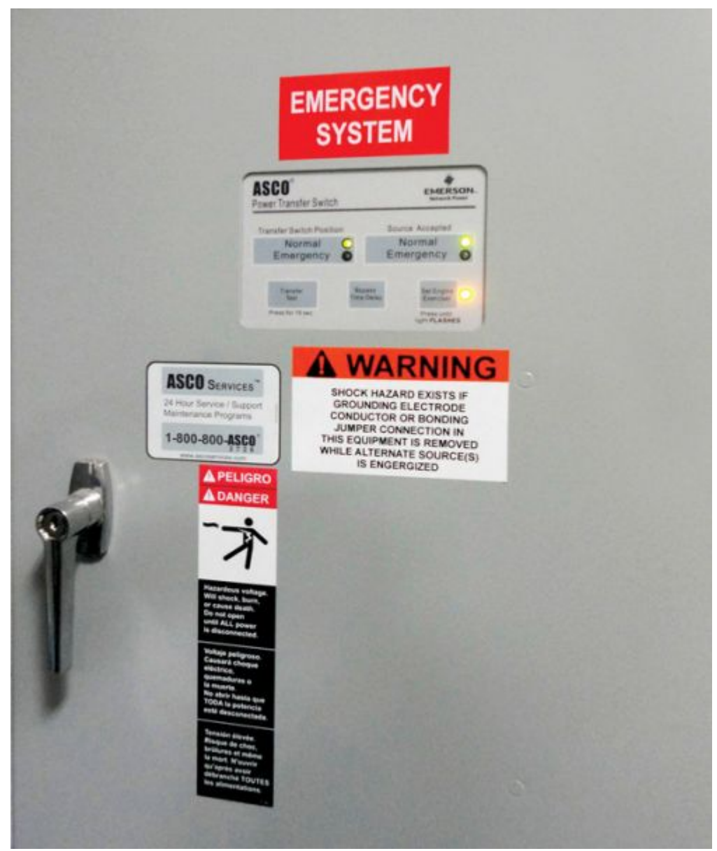
Photo 3. This transfer switch shows examples of how both labels are implemented in an end-user application.

The 120V system is usually wired in black, red, and blue while the 277V version is wired in brown, orange, and yellow. While a 120V system is usually wired in black, if you have a 120/240V delta with a high leg, then the phases end up being in black, orange, or blue. The black and blue are industry standards not required by code. But any time you have a delta with a high leg, the high leg must be orange (per Code requirements). So, in theory, you could identify a 120/240V delta in brown, orange, or yellow, but it is not common.