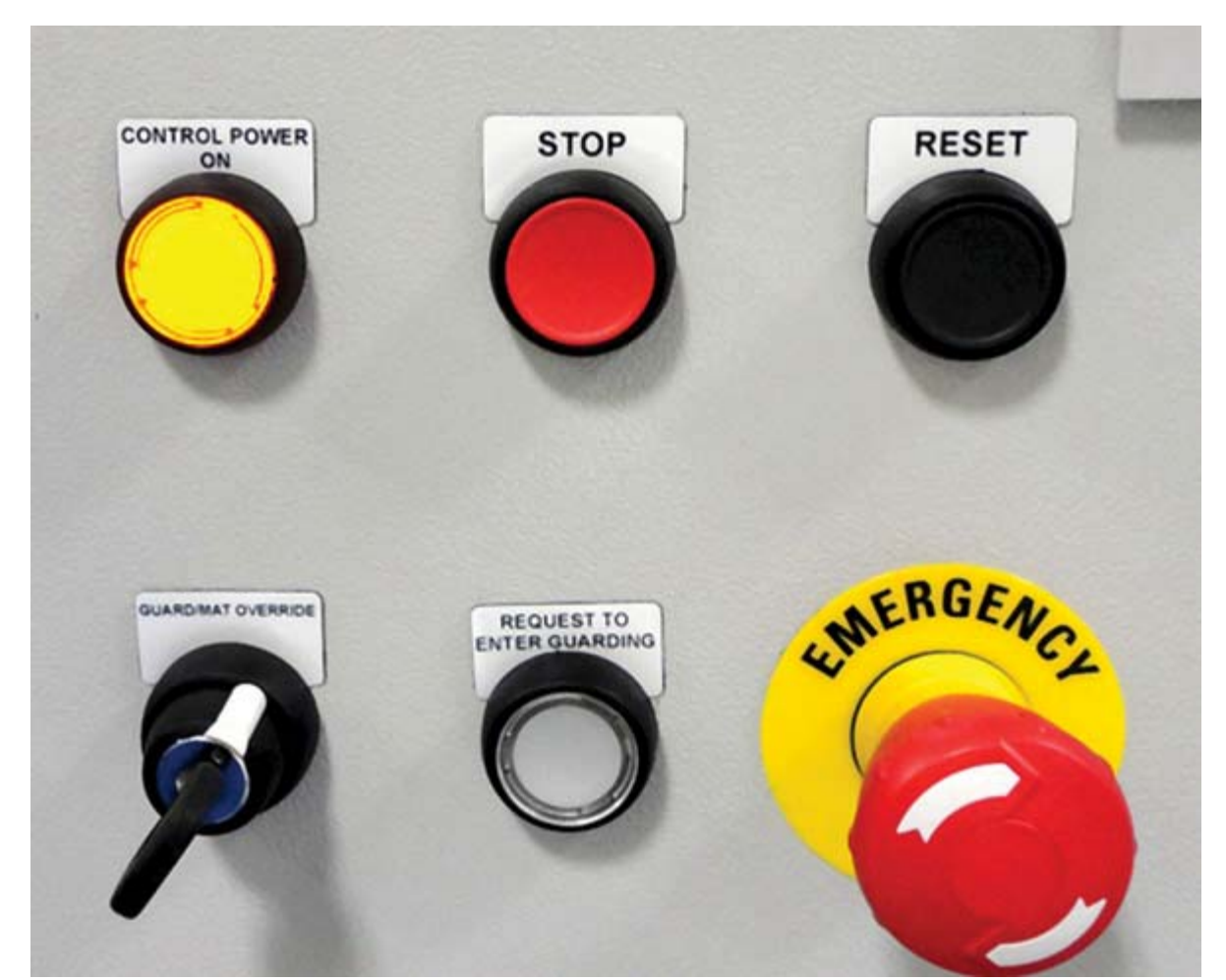
Photo 5. Even the emergency stop label is defined under NFPA 79-2011 Article 10.7.3 and is required to be yellow.

Industrial automation labels can vary widely in verbiage and application. Warning, danger, and caution signs indicate different levels of potentially hazardous situations. The "signal" word needs to be at least 50% larger than the body text. The "safety alert" symbol is used in conjunction with the signal word ( Photo 6 ). Typically, the word "caution" is displayed in black letters on a yellow background ( Fig. 4 ), the word "warning" is black letters on an orange background, and the word "danger" is white letters on a red background.