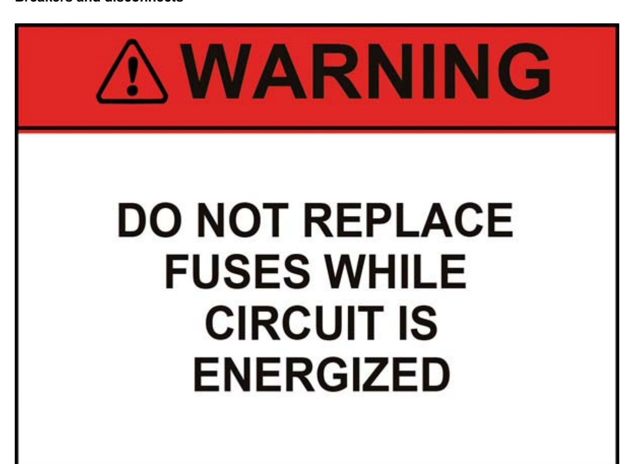
Fig. 3. If one has a medium-voltage substation in a facility, then this label would be placed on anything 600V or higher. Anything under 600V has the fuses contained in some type of disconnecting means that will automatically turn off power if the user attempts to access the fuses.

For overcurrent devices, NEC 225.70(3) states that suitable warning signs shall be erected in an obvious place adjacent to fuses, warning operators not to replace fuses while the circuit is energized. As we can see in Fig. 3 , if you have a medium-voltage substation in a facility, then you would place this label on anything 600V or higher. Anything under 600V has the fuses contained in some type of disconnecting means, which will automatically turn off power if the user attempts to access the fuses. Appropriate labeling as shown is critical, but many times easily ignored or simply not enforced.