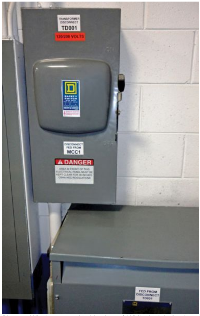
Photo 5. What's wrong with this picture? While the labeling is correct, there is a very blatant safety violation with the installation of the service disconnect feeding a separately derived system transformer in this case. The disconnect is located partially above the transformer. This installation violates Sec. 110.26 of the NEC. The depth of the transformer extends out past the front face of the disconnect, violating the clear space requirements in front of equipment that may need service while energized. Remember to always look to the codes and do not copy things that may be found pre-existing in the field.

Having the ability to prevent power loss to critical industrial automation and industrial control panels is essential to any business and important to the health and safety of those in charge of operating and maintaining such systems. The panelboards are considered branch circuits. As such, the path of power into and out of these panels is just as important as the main power, and vertical feeders and should be labeled and maintained to the highest standards possible ( Photo 4 ).