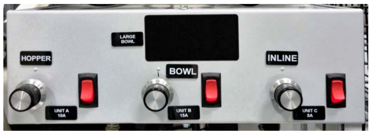
Photo 3. Per the 2012 edition of NFPA 79, Article 16.3, control devices, visual indicators, and displays used in the operator machine interface shall be clearly and durably marked with regard to their function either on or adjacent to the unit.

Per Sec. 205.10 of NFPA 70E, 2012 Edition, identification of components (where required) and safety-related instructions (operating or maintenance), if posted, shall be securely attached and maintained in legible condition. Up-to-date operating and safety instructions and necessary warnings are vital to ensure employee safety for industrial automation.